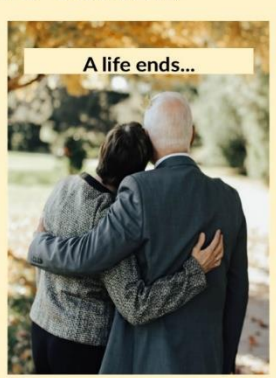
We are here for you.