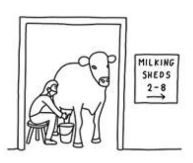
8 MAIDS A-MILKING ALLOWED TO CARRY ON (ESSENTIAL WORK)