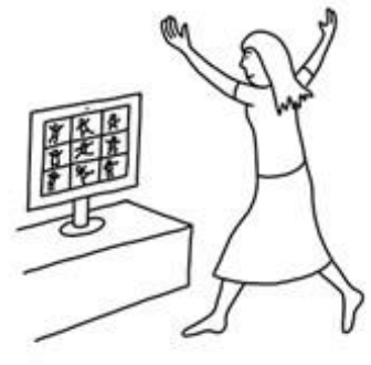
9 LADIES DANCING OVER ZOOM