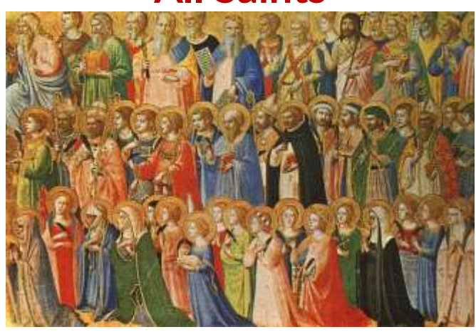
10.30am Parish Communion

(In Church and Facebook Live) Adult Choir